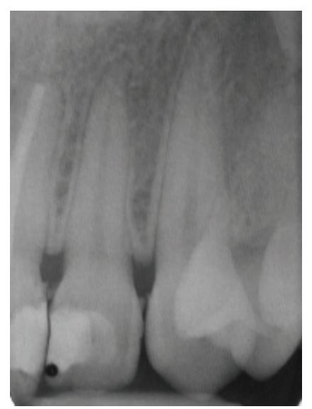
Figure 5: UL1 and UL2 pre-op

technique would whiten the discoloured teeth.