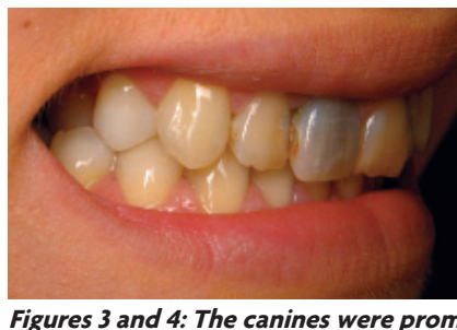
Figures 3 and 4: The canines were prominent and rotated bucco-distally