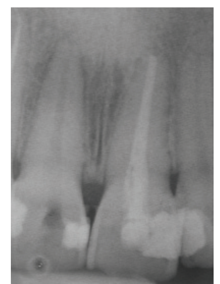
Figure 7: UR1 and UL1 pre-op