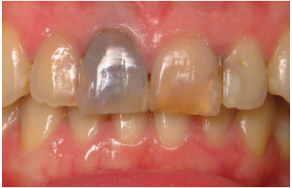
Figure 2: Discolouration and incisal wear of the upper central incisors